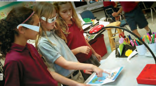
McKeel Elementary Academy students produce work for authentic audiences.

and ownership over their learning, as well as allow them to bring their observations into the subsequent lesson, discussion, or creation activity as prior knowledge.